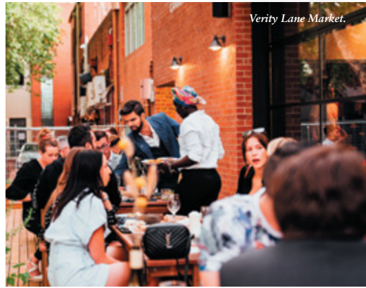
Verity Lane Market.