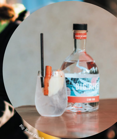
Big River Distillery.

Canberra's craft brewery and distilling scene packs some punch. Their products now regularly appear in award lists.