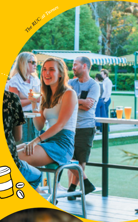
The RUC at Turner.