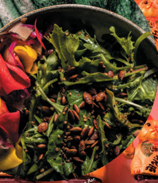
Monster Kitchen + Bar.