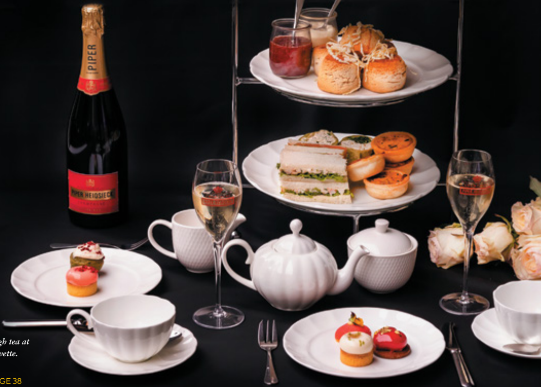
High tea at Bwette.

Imagine indulging on tiered plates of delicious cakes and tarts, sipping on award-winning tea in heritage-listed venues, or enjoying a glass or two of champagne in plush surroundings.