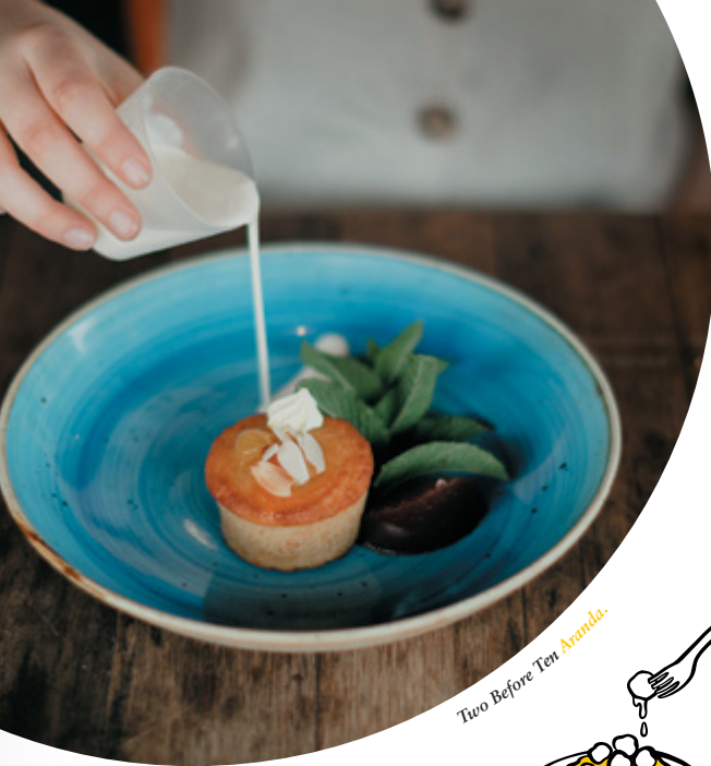
Two Before Ten Aranda.