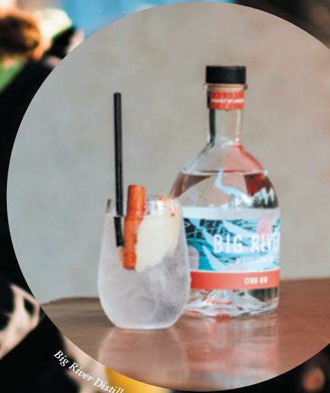
Big River Distillery.

Canberra's craft brewery and distilling scene packs some punch. Their products now regularly appear in award lists.