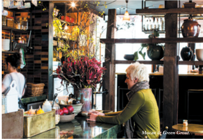
Mocan & Green Grout.