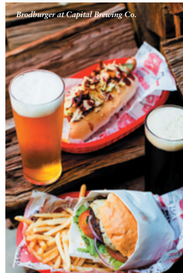
Brodburger at Capital Brewing Co.