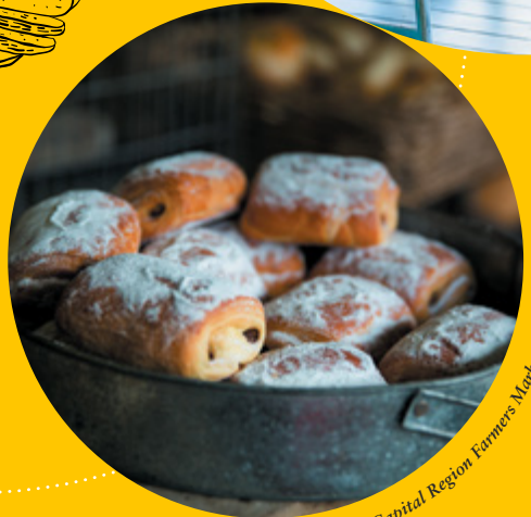
Croissants at the Capital Region Farmers Market.