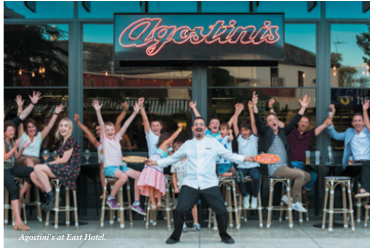
Agostini's at East Hotel.