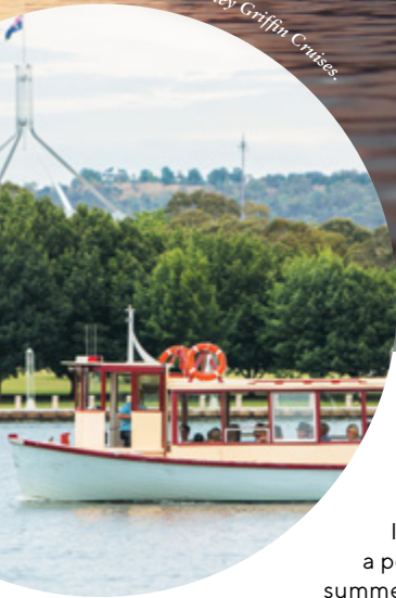
Lake Burley Griffin Cruises

The glistening centrepiece of the capital, Lake Burley Griffin, has been dubbed a water playground with more than just lakeside activities on offer. Glide across the water with picnic boats, stand up paddleboards, paddle boats and cruises.