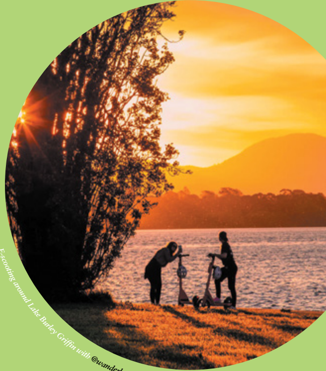
Escorting around Lake Burley Griffin with @vanderlust73.