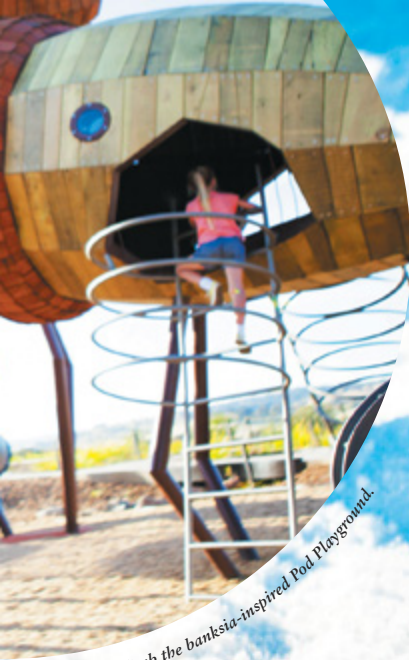
Climb the banksia-inspired Pod Playground.