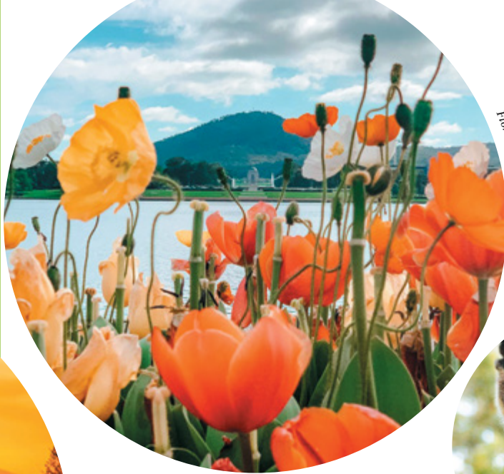
Flortide with @marerrooms.