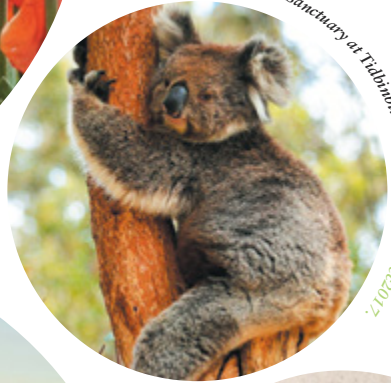
The Sanctuary at Tibbilla with @pfpinsondce2017.