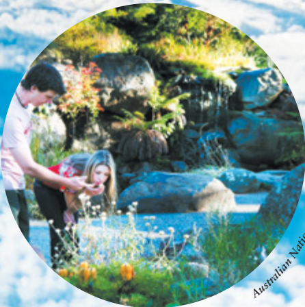
Australian National Botanic Gardens.