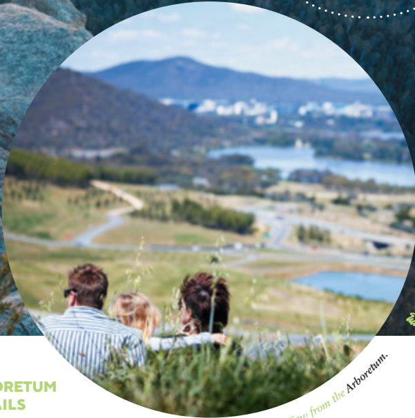
View from the Arboretum.

The knowledgeable staff at Namadgi and Tidbinbilla Visitor Centres provide great advice about walks that may best suit you.