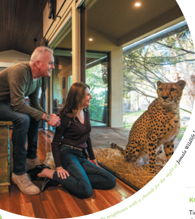
Be neighbours with a cheetah for the night at Jamala Wildlife Lodge.