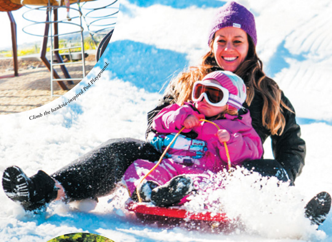
Toboggan at Corin Forest.