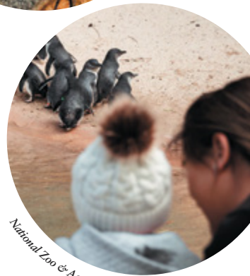
National Zoo & Aquarium with @harperyeats.