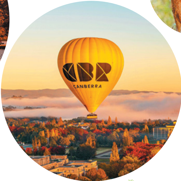
Hot air ballooning with @simplycheeky.