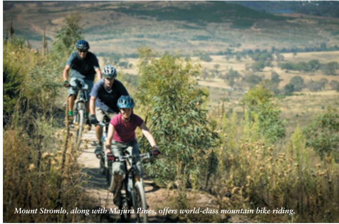
Mount Stromlo, along with Majura Pines, offers world-class mountain bike riding.

Lake Burley Griffin is Canberra's centrepiece and a ride around this beauty will take you to many beloved city icons. Galleries, museums, a zoo and aquarium, an arboretum, scenic wetlands, cafes and breweries all call the 40km shoreline home. The ride is mostly flat and predominantly uses bike paths.