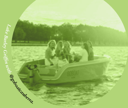
Lake Burley Griffin with @boboutcanberra.