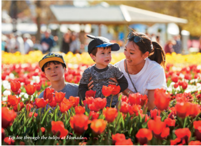
Tip toe through the tulips at Floriade.